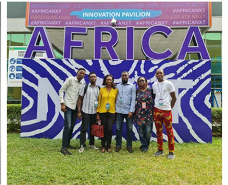
Chenistars at the Africa NXT 2022