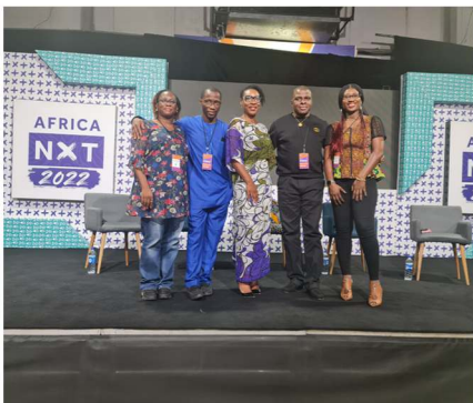
Panelist at the Chenist Communications session at Africa NXT 2022